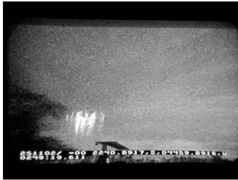
Figure 1. An example of sprite recorded in 25 November 2002 at 02:49 UT in the Southeast of Brazil. See color version of this figure in the HTML.

23 Impact and LPATS sensors located in the Southeast and surrounding regions of Brazil. In all cases in Table 1 that a sprite-parent lightning was identified, the delay time between the time of the sprite and the time of the lightning event was lower than 10 ms.